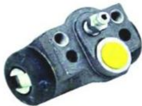
IZQ - 801203