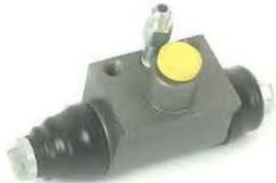
IZQ - 800104