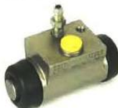
IZQ - 800990