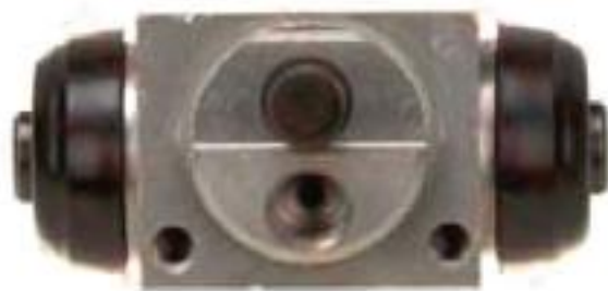
IZQ - 801170